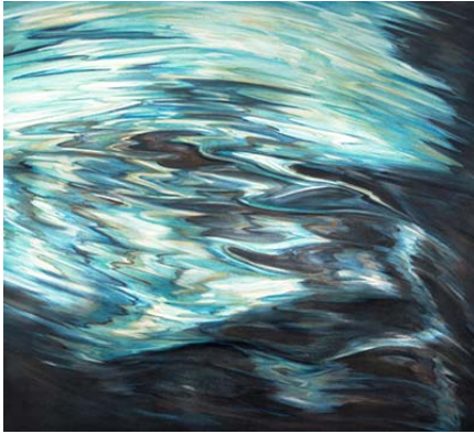
Gonzalo Ruelas, L'Arno , 2013.

The young Mexican artist Gonzalo Ruelas paints moments of transformation in oil and acrylic on medium-size formats: landscapes, perceptions of nature and animals, which he transforms into shadowy faces and bodies ( Alato - Geflügelt, Bosque - Wald, Musgoso - Moos, Coral -Koralle, Otoñal - Herbstlich, Corna - Horn). His observations and imaginations are often based on concrete details, which he elevates to bizarre, almost surreal beauty and which gain an animal-soulful strength. The large tryptich Kreuz auf Cempasúchil (2018) appears like a landscape, but at the same time quotes a flower from the legendary multileaved flower Cempasúchil from the Mexican "Day of the Dead".