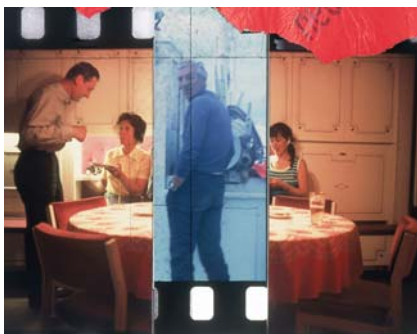
Ulises Urra, Inconcluso, Digital Print, 2013 (Detail)

Islands, steamers, sailing ships - the ocean speaks from the drawings in the series "Three Years of the Sea" by Milana Novčić . Created between 2004 and 2006, In these countless Sea-pieces waves, landscapes, letters, mermaids, fish people, seagulls are lined up. Novčić used colored pencils and ballpoint pens to process daily experiences as well as literary motifs. With a light hand she distributes the various picture elements in a rhythmic composition over the sheet. Changing perspectives are taken, noises float as dynamic signs. Novčić deals with the sensuality of memory, the phenomenon of repetition and the expansion of time. In her colorful painting as well as in the drawings, she pushes figuration to the point of abstraction. Portraits, masks, bizarre angels shine and light up. In mixed media on canvas there is also to watch "The Scream" (2021) as a reminiscence of Edvard Munk.